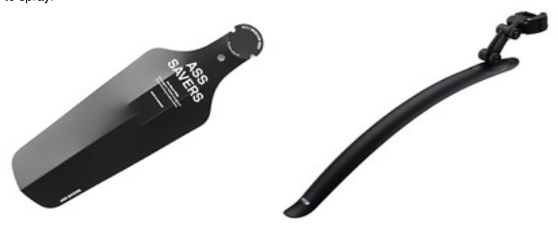
HOPEFULLY THIS HAS BEEN HELPFUL.

The products of this type will give the rider some protection but will still leave your club-mates exposed to spray.